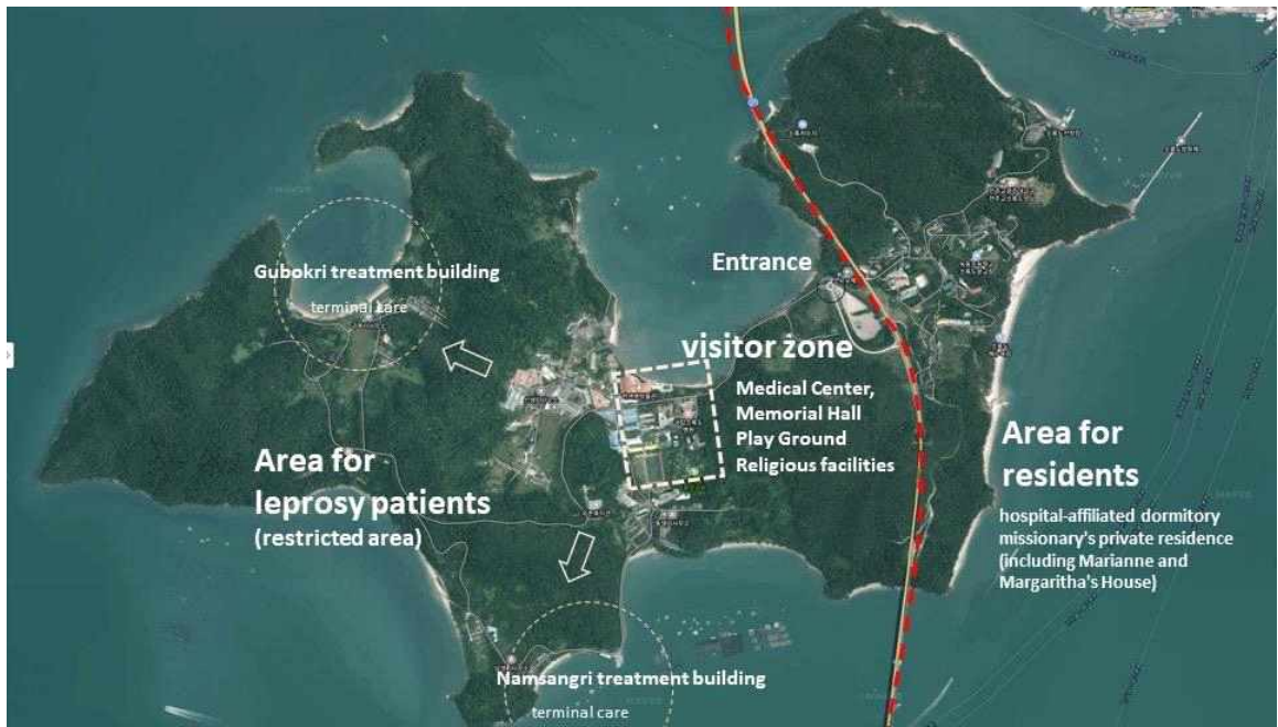
Area separation in Sorok island